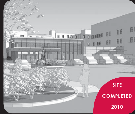
SITE COMPLETED 2010

We are pleased to announce the new state of the art Emergency Department located at the Kingston Campus of the HealthAlliance of the Hudson Valley™, expected to be completed by December 31, 2009. This extraordinary endeavor brings together two separate institutions as one, united in the desire to provide excellence in the care of our community.