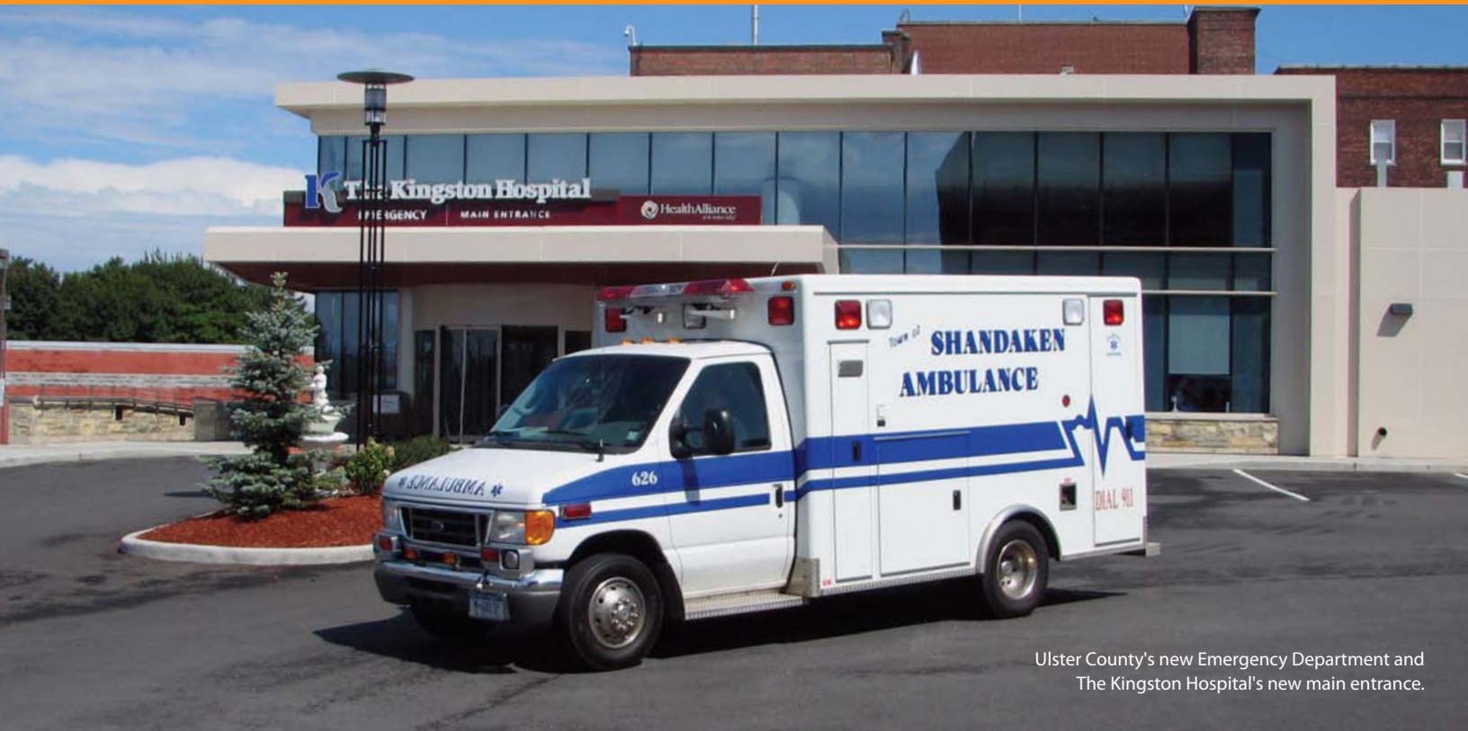
Ulster County's new Emergency Department and The Kingston Hospital's new main entrance.