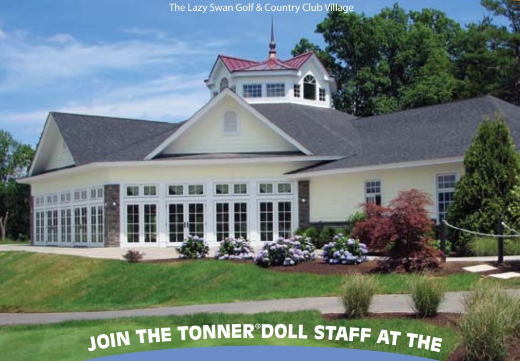
The Lazy Swan Golf & Country Club Village