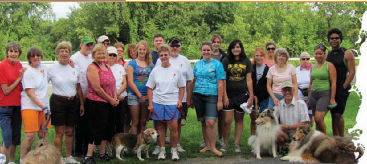
Walkers from the O&W Rail Trail Walk, August 14.

Note: Many of our donors choose to restrict their bequest commitment to a particular department or service at The Kingston Hospital. Please let us know if you would like to restrict your gift and we can help craft language that appropriately reflects your wishes.